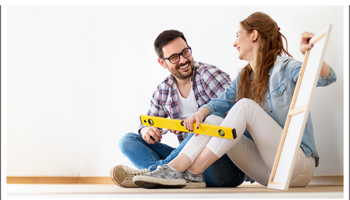
Earn a $200 Cash Bonus<sup>1</sup> with a Home Equity Line of Credit.

Put your home's equity to work for you with a Home Equity Line of Credit. A Home Equity Line of Credit, or HELOC, offers you a flexible Line of Credit for a variety of needs by using the equity on your home. Right now, you could earn a $200 cash bonus when you open a HELOC from BMI Federal Credit Union.