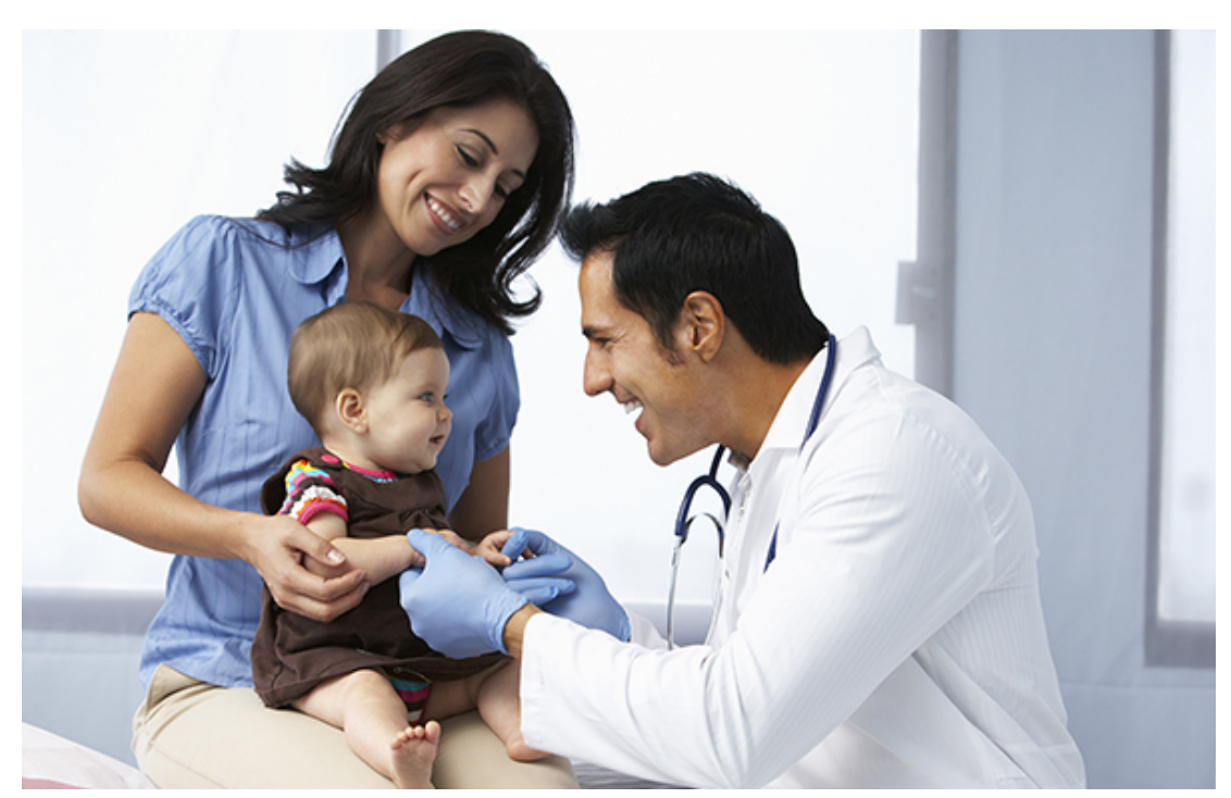
Health Savings Accounts (HSAs)

BMI FCU offers Health Savings Account (HSA) Checking Accounts to help you save money while managing your healthcare payments. Explore the benefits of a BMI Federal Credit Union HSA.